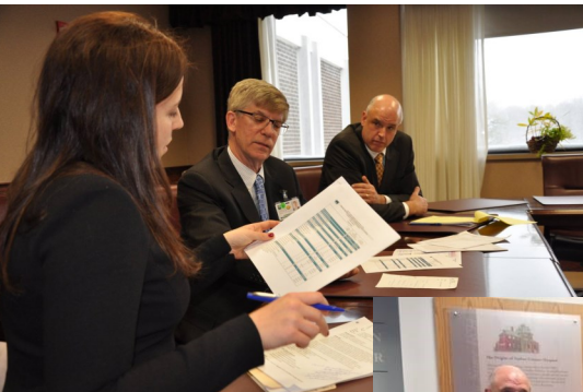
February 9, 2015