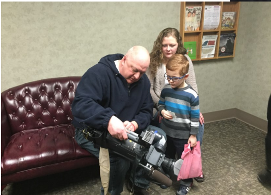
February 25, 2015