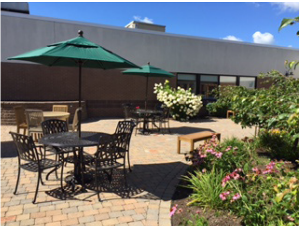
Auxiliary Reflection Garden