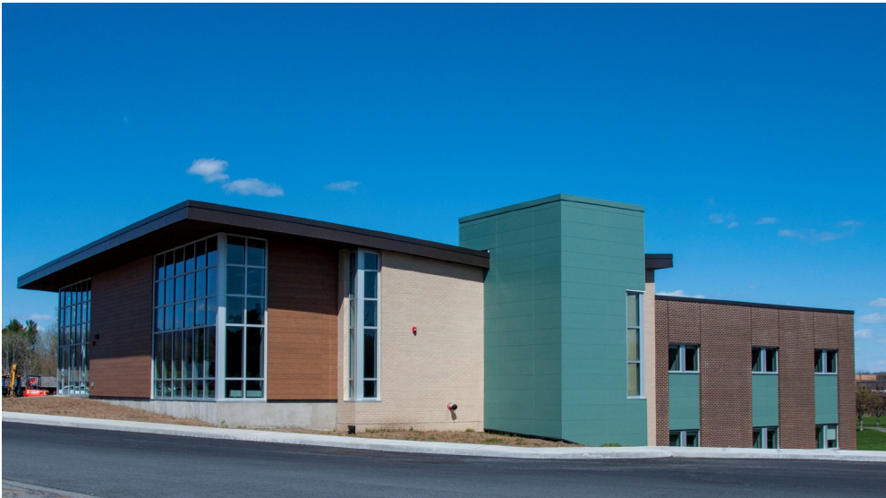
Our new on campus Medical Arts Building