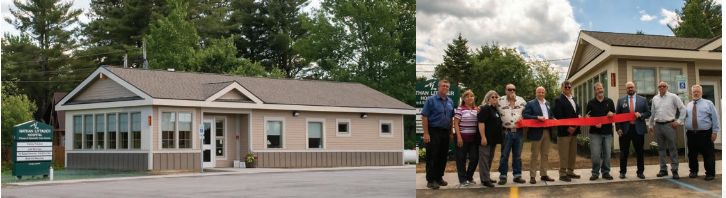
Our Caroga Lake Primary Care Center, completed in 2020, has been providing accessible healthcare services to the people of Caroga Lake. The care center has seen a total of 1,397 patients in 2021!